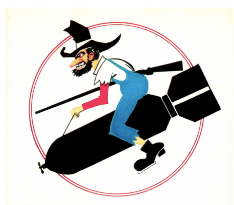
730th BOMB SQ., L. NIGHT INTRUDER

On a disc white, edged with a double line red, the representation of a "Rebel", overalls light blue, undershirt red, shirt white, hat black, white band, shoes black, carrying a shotgun black, and riding a bomb also black. The rebel is significant of the nickname that has been associated with the unit throughout its history. The rebel is symbolic of determination, aggressiveness, and ruggedness, qualities associated with the mission of the 730th Bombardment Squadron, Light, Night Intruder. The bomb represents the night operations of the unit. (Approved, 14 Dec 1951.)