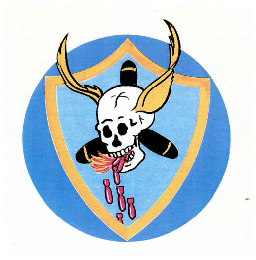
730 Bombardment Squadron, Heavy emblem